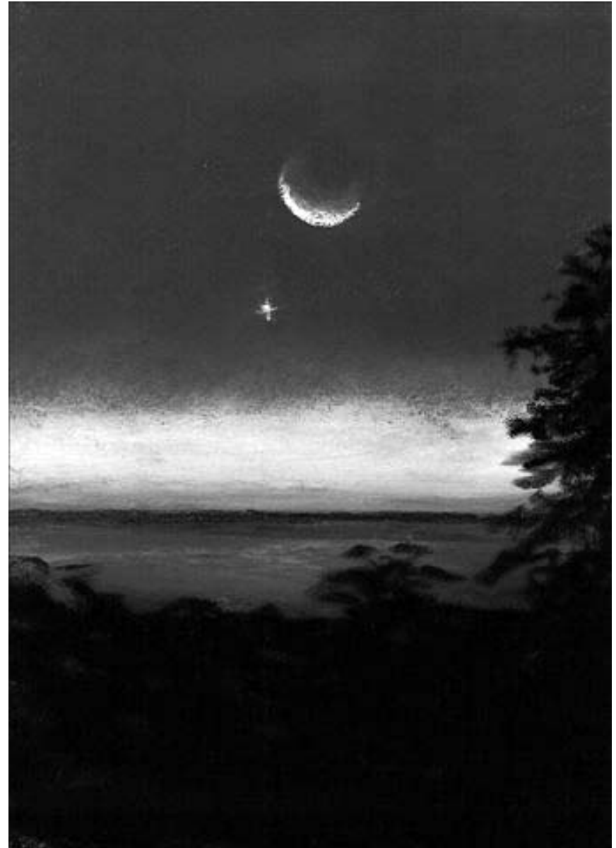
Gretchen Gullicksen Grant