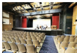
Exhibit space, 40-seat theatre; perfect for special events