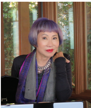
Amy Tan New York Times bestselling author of Joy Luck Club